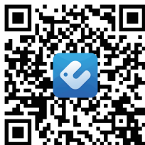
App Download Linkage

Scan the QR code or search "Ewpe Smart" in the application market to download and install it. When "Ewpe Smart" App is installed, register the account and add the device to achieve long-distance control and LAN control of smart home appliances.