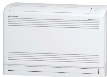
SRF25ZS-W, SRF35ZS-W, SRF50ZSX-W